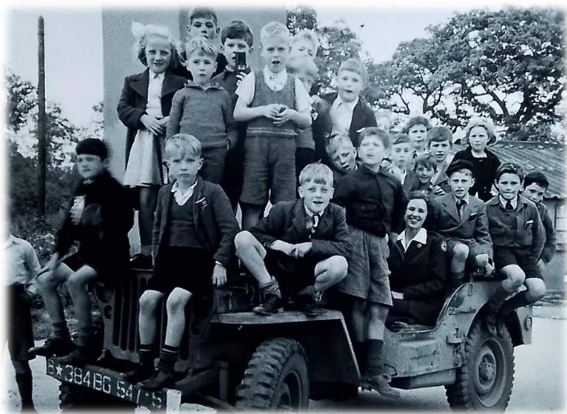
London refugee children on a Grafton Underwood jeep