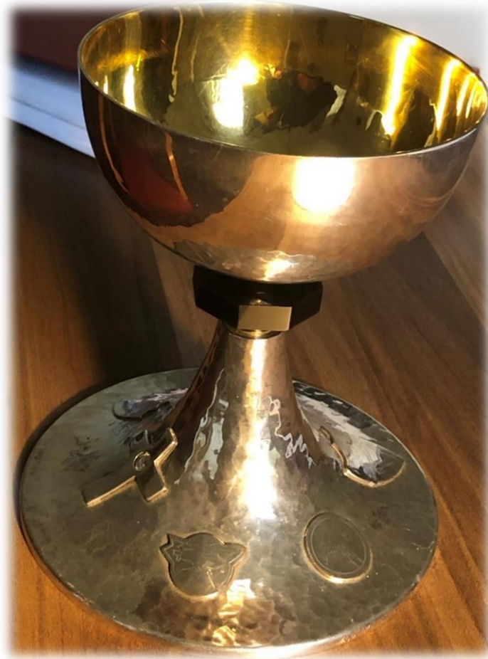
The chalice, please note the diamond of the ring visible on the cross