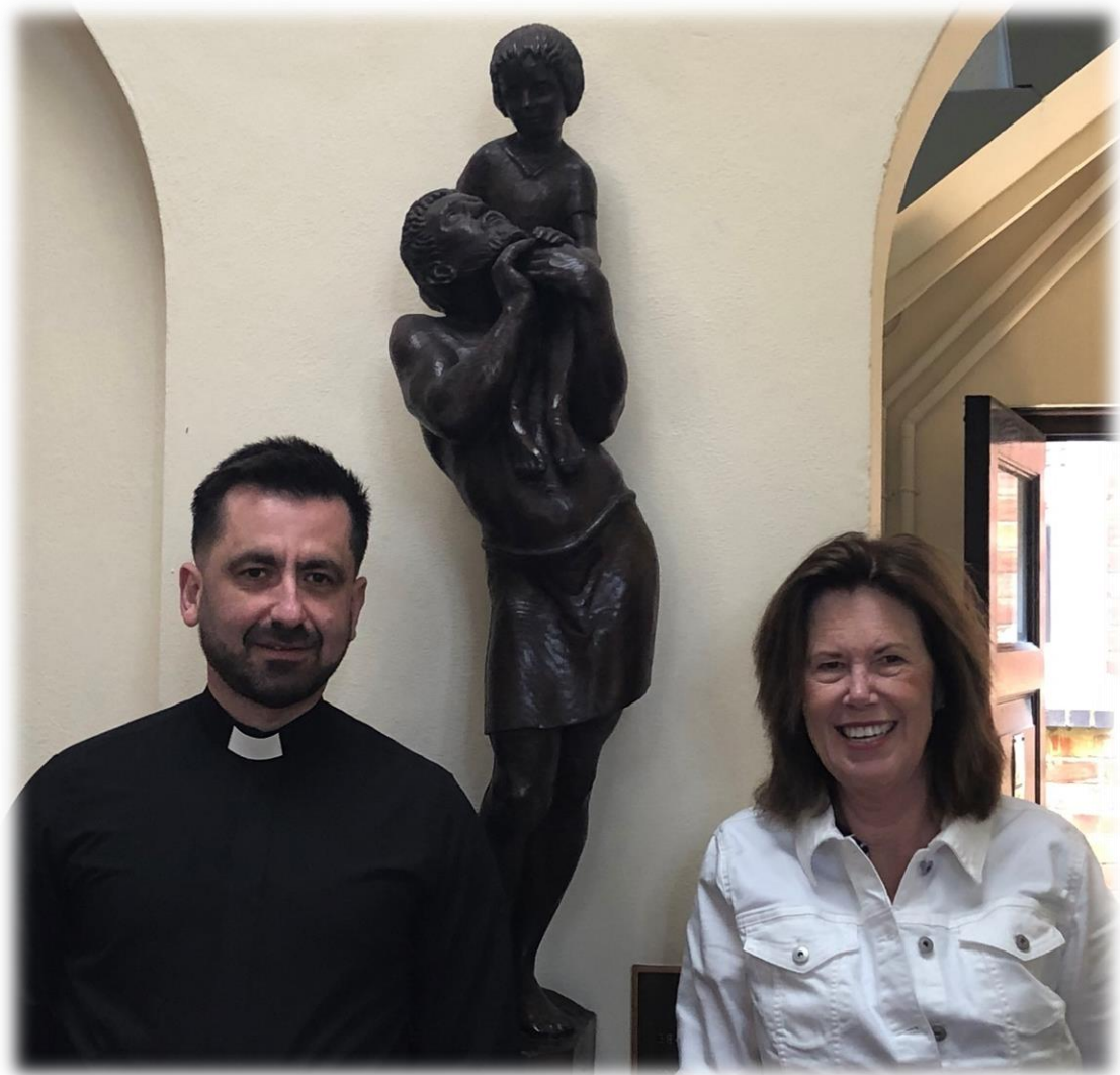
The wooden carving of St Christopher carrying Jesus