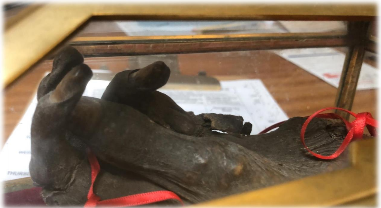
Mummified hand of St James at St Peter's Church in Marlow.