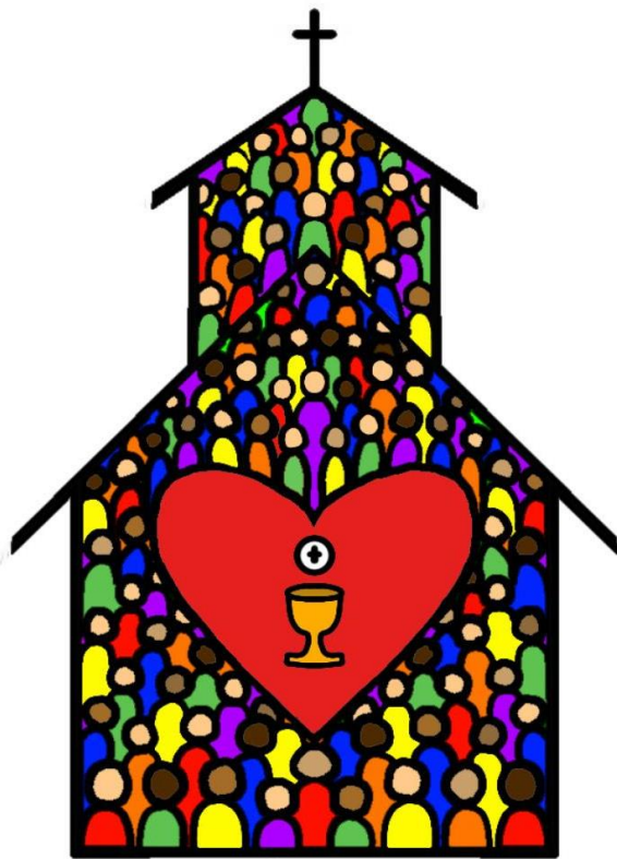
The Bethany Group