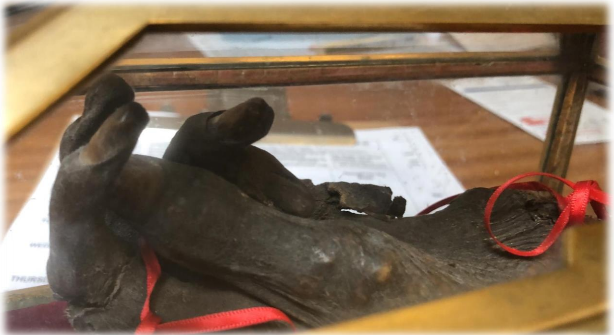
Mummified hand of St James at St Peter's Church in Marlow.