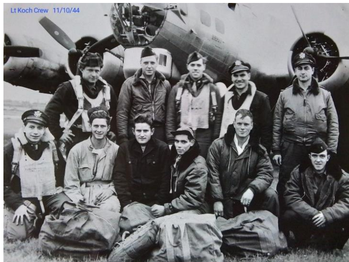
One of the crews