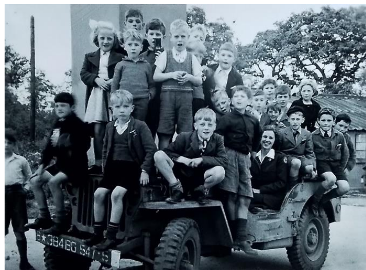
London refugee children on a Grafton Underwood jeep.