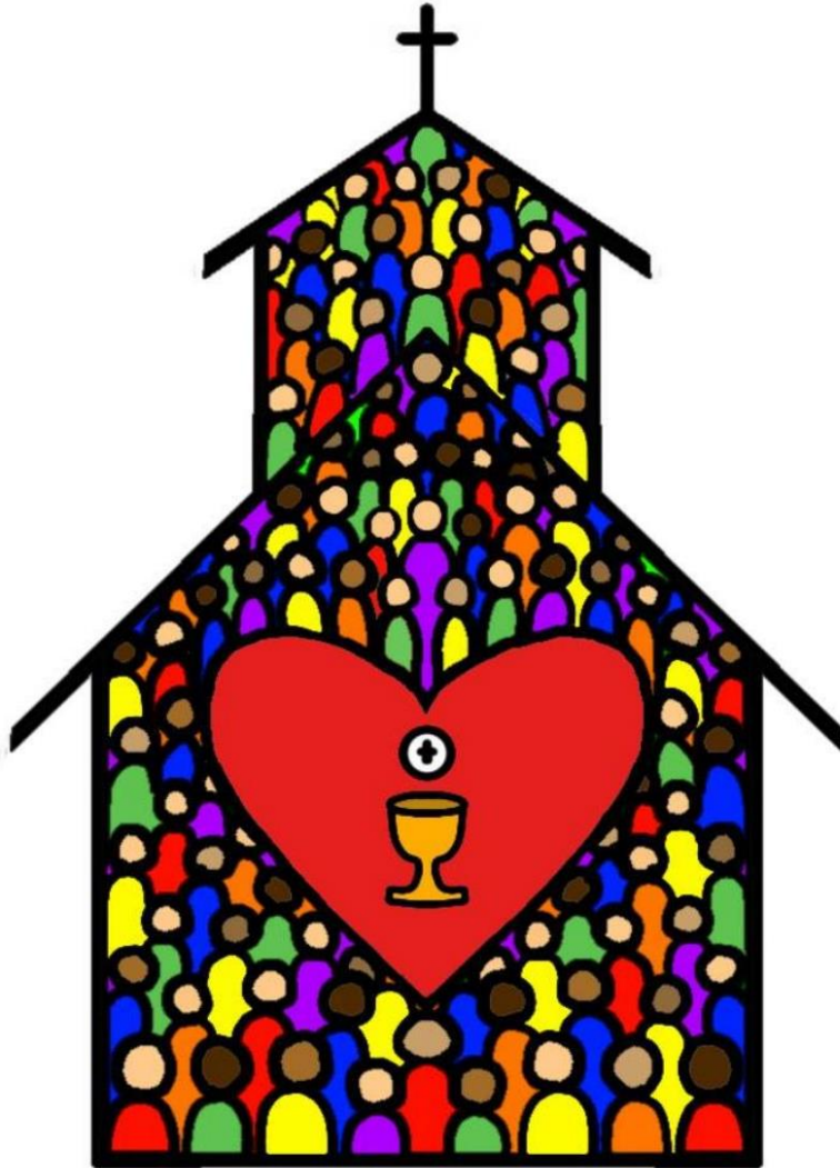
The Bethany Group

We are a Diocesan group for those with special or additional needs and their families. It is called The Bethany Group.