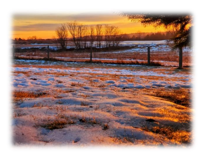
Wednesday, CHRISTMAS DAY