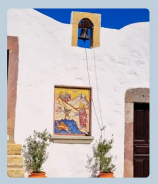
"Do not be afraid, I am the Alpha and Omega' said the Lord."