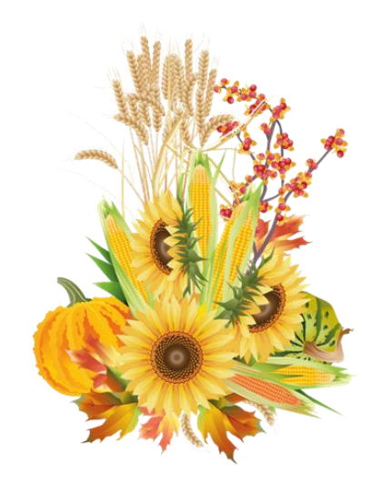
For through your goodnessWe have received the bread we offer you:Fruit of the earth and work of human hands,It will become for us the bread of life.