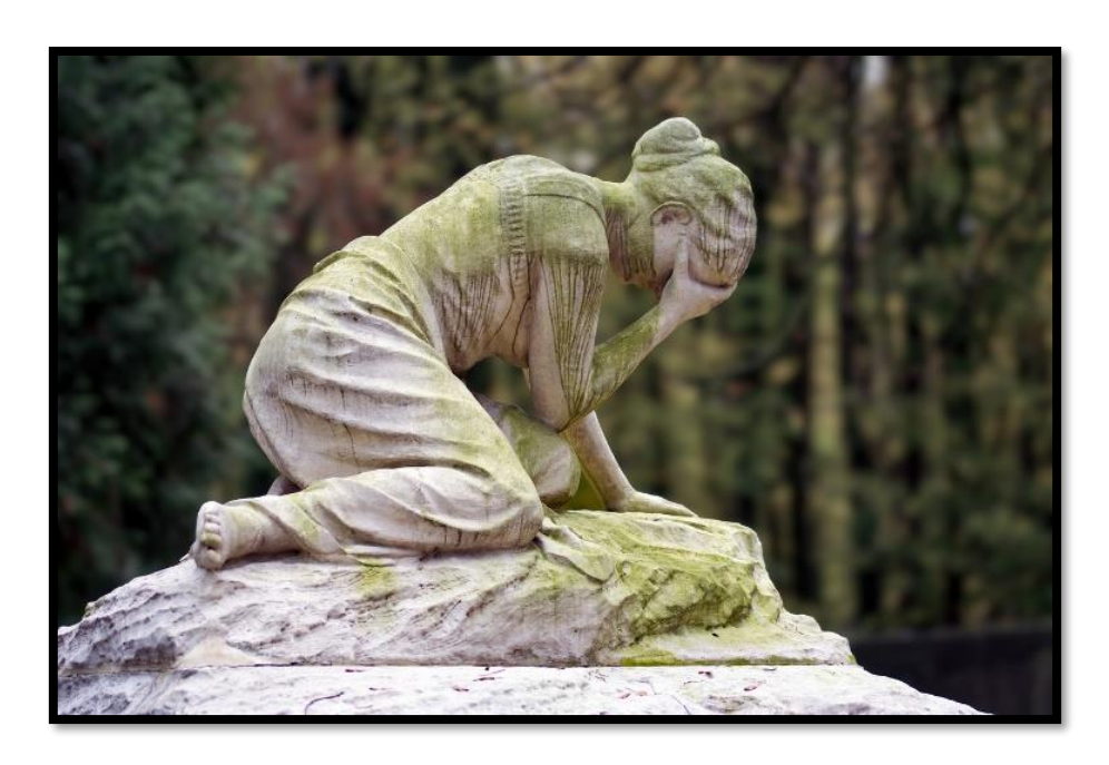
They are not the ones who are dead, we are the ones who die, they are the ones who live eternal life.

We all know that bereavement might be a painful and emotional time for those who lost their loved ones. Perhaps you yourself are experiencing this or somebody you know is. Please consider joining us. Pain and sadness caused by death is not as difficult if you can share it with others who are in a similar situation.